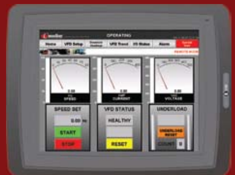
ESP Operating Screen

All ACT-VFD's are manufactured with full Canadian Standards Association (CSA) certification.