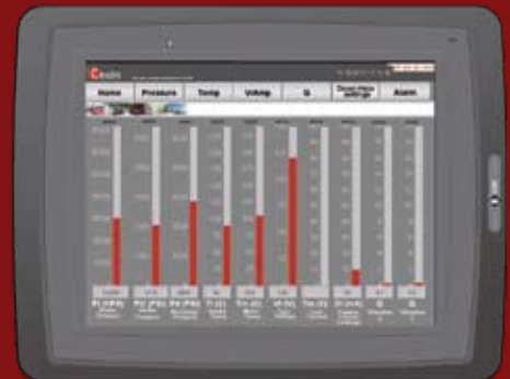
Downhole Sensor Readings Screen