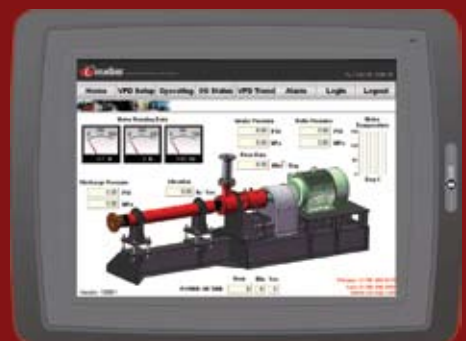
HPS Operating Screen